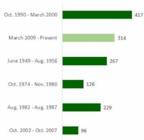
The six largest S&P 500 bull markets, in % return

*As of 6/30/2018