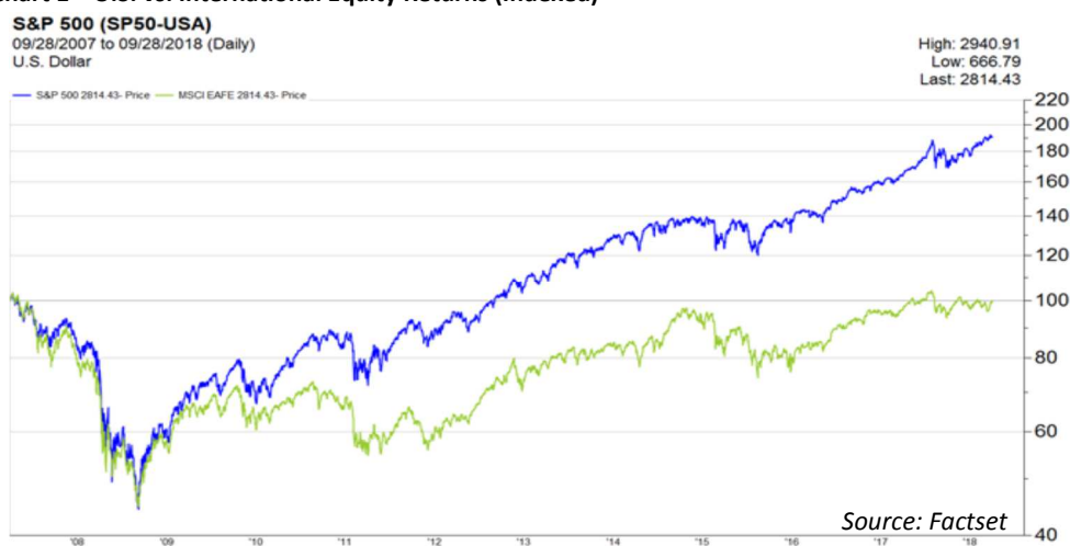
Chart 1—U.S. vs. International Equity Returns (Indexed)

Despite the performance results of the domestic benchmark far exceeding those of its international counterpart, the performance of Dividend Growth stocks has been comparable regardless of geography. Domestic Dividend Growers have posted a 12.8% annualized re-